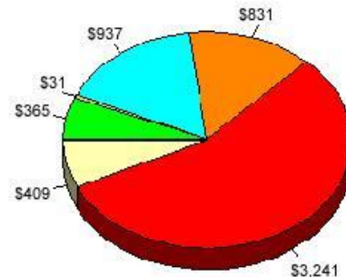
Total US nuclear weapon costs for 1946-1996.